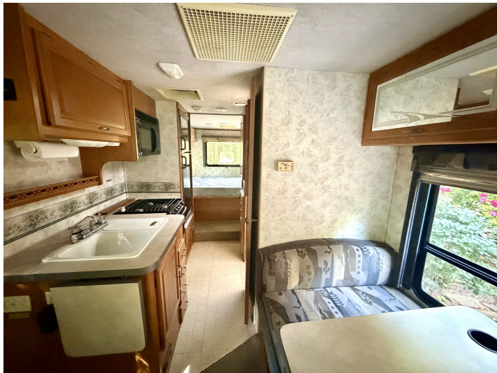
Galley, dinette, and main aisle