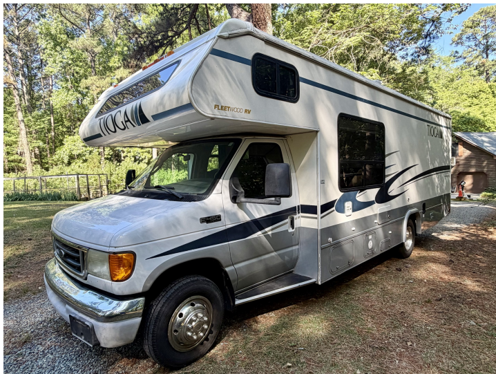
Entry side and exterior profile