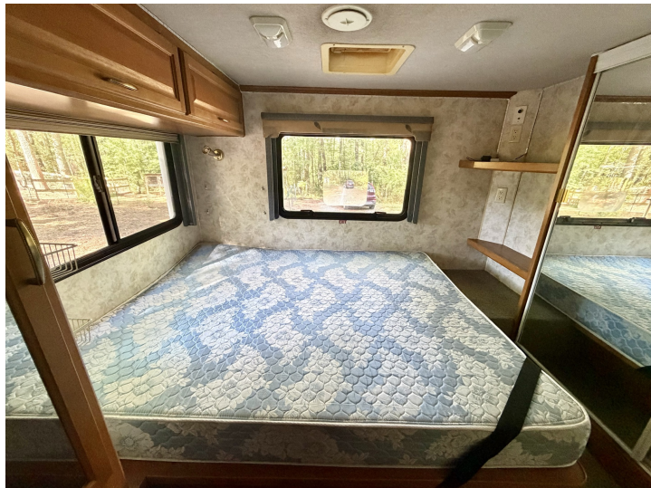
Rear queen bed