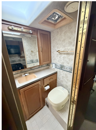
Bathroom vanity and toilet area